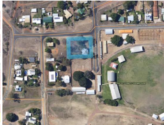
Figure 2 – Aerial photograph