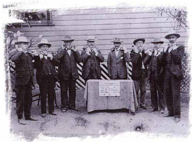
Group of mine managers and owners with two gold bars on their shoulders - evidence of the abundance of precious ore found in Charters Towers.